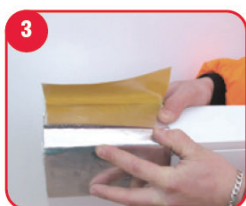
3 Wrap around service to a tight fit