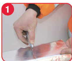
1 Cut to depth of wall