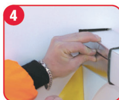
4 Fix self adhesive flap