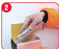
2 Cut along line, trim to fit